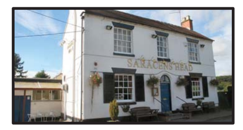
So come visit us & bring the whole family along if you like!

Indeed we have our own resident little dog 'Bella', she visits the pub on occasion but her main job it is to ensure a good supply of those all important dog treats!