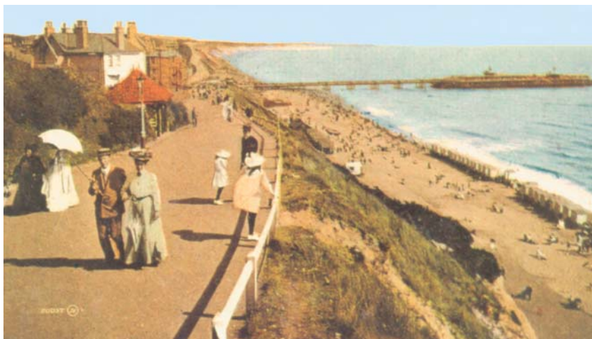
Bournemouth from West Cliff