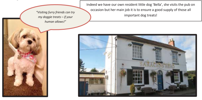
So come visit us & bring the whole family along if you like!

As a family run business we realise the importance of being able to include the whole family when going out to dine. We therefore welcome well-behaved dogs to come along whilst their owners enjoy our delicious range of food & drinks.